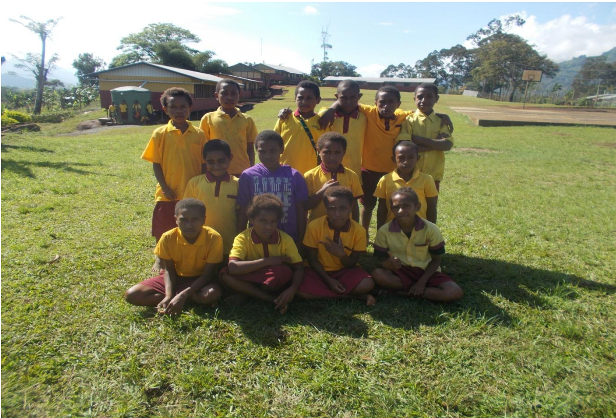
Kumbareta Primary School –WHP