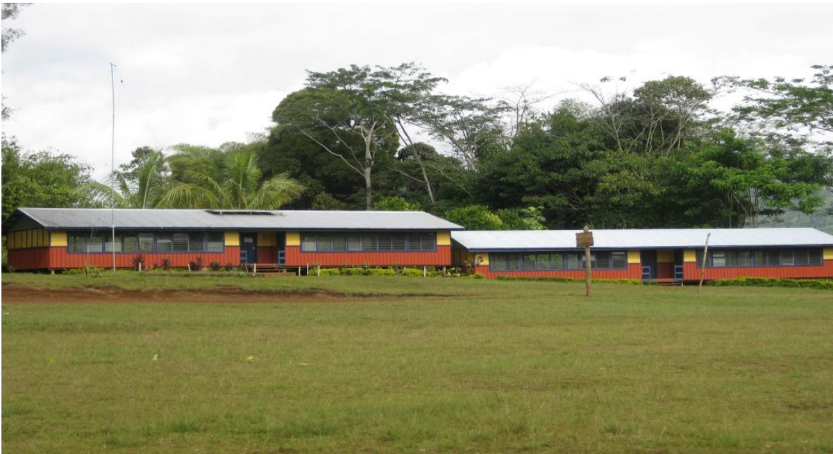
Dalapana Primary School (Baiyer, WHP)