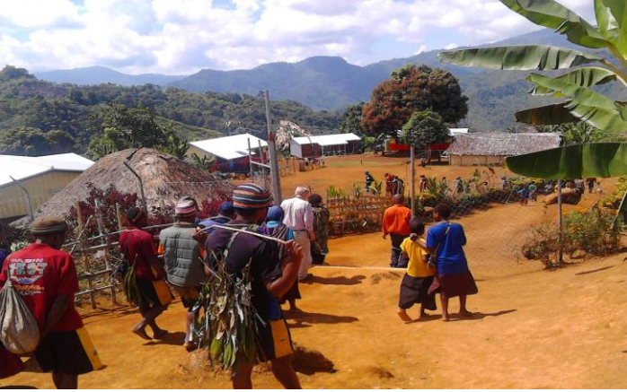
Yangis Primary School – Kompiam (Enga Province)