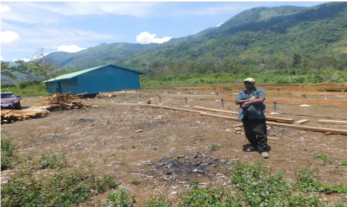
New Ukinin Maiwa Baptist High School under construction 2019-2020