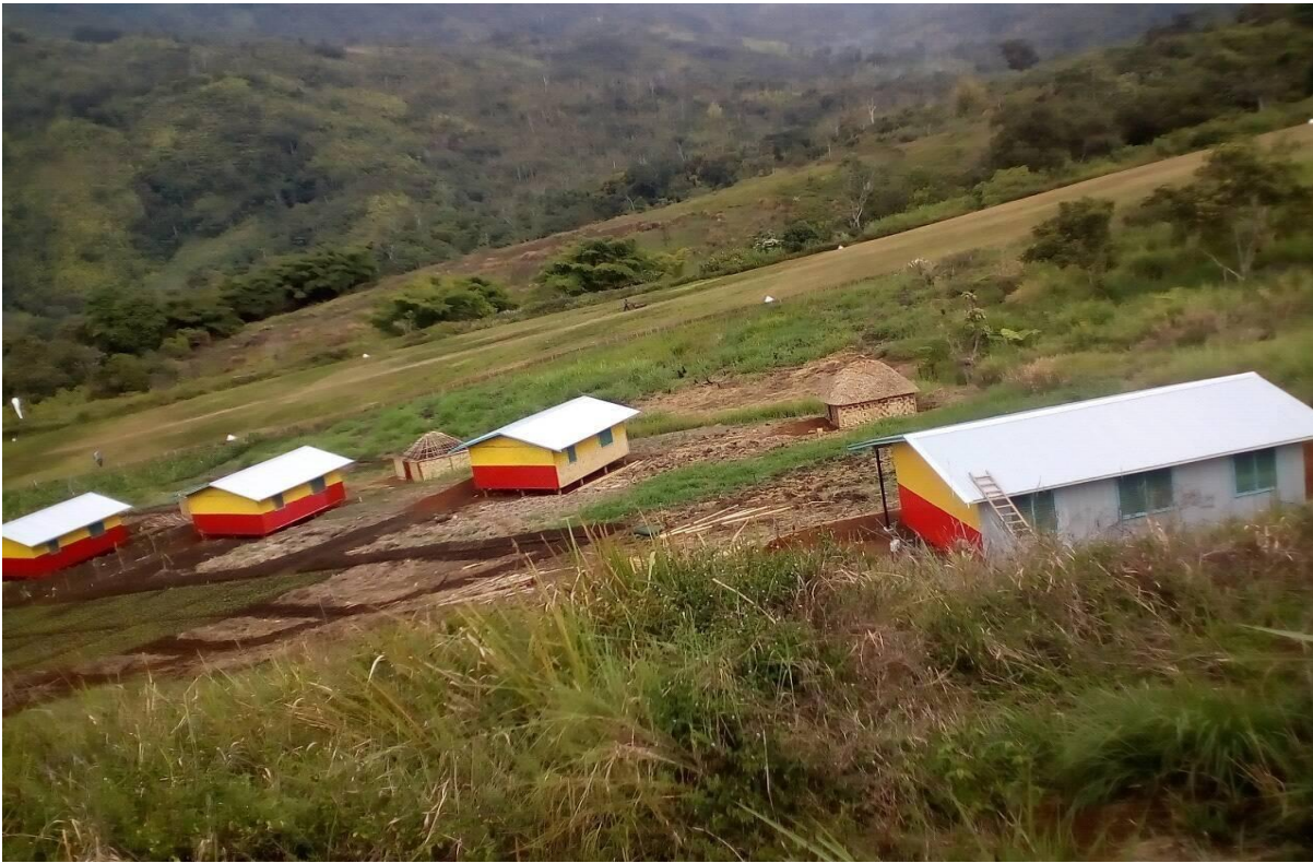
Lapolama Primary School – Kompam (Enga Province) -2016