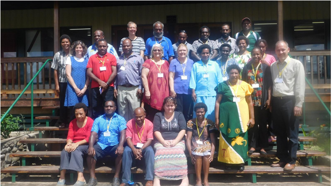
Educators Conference for Baptist Teachers