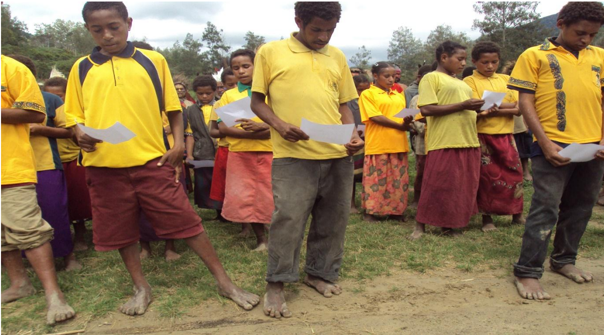
Tomianap Primary School – Telefomin District (Sandaun Province)