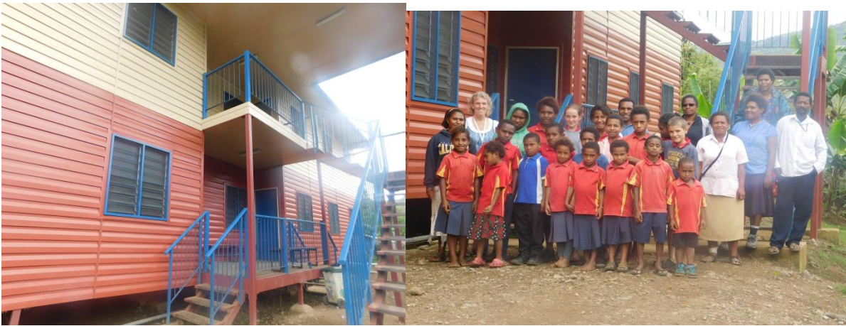
Kompiam International School