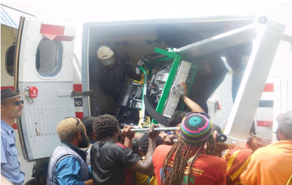
Delivery of Lucas Mill to build classroom & staff houses in Enga Baptist Union (Lapolama Primary School)