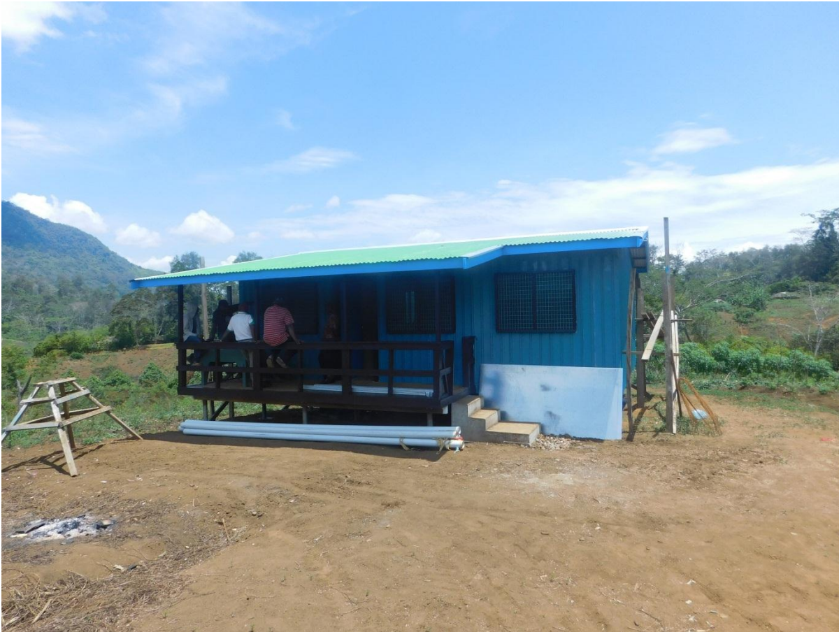
First staff house & the second double classroom