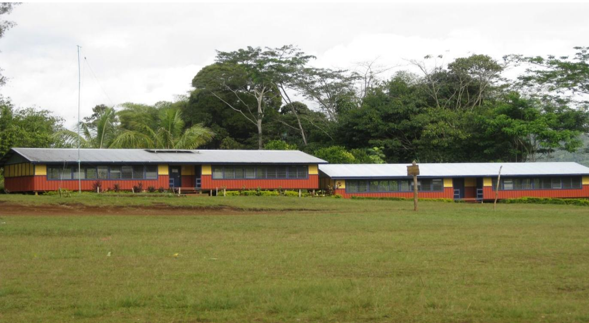
Dalapana Primary School – Baiyer (WHP)