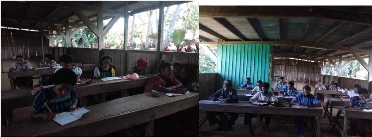
Adult Literacy Training