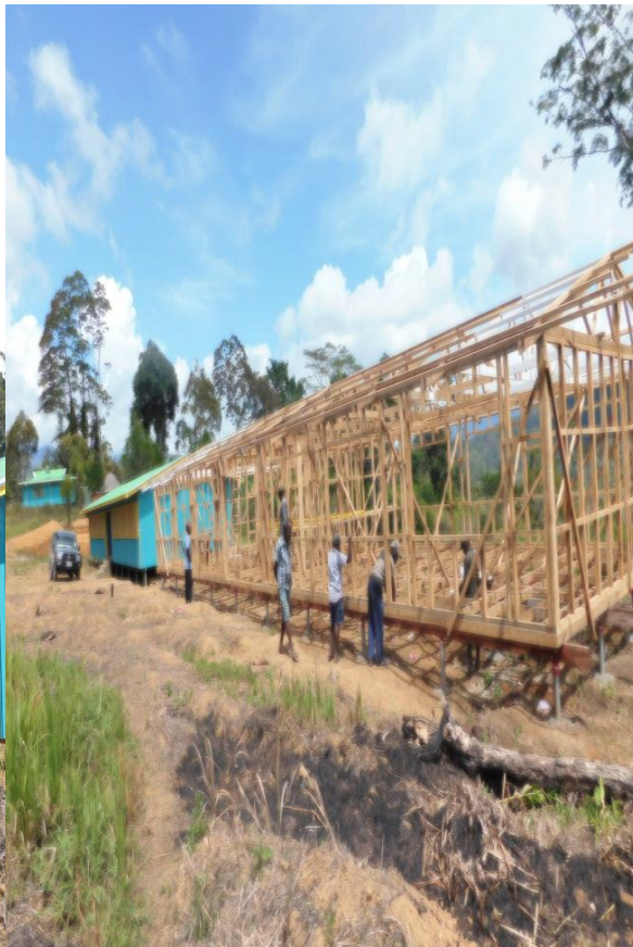
New Lumusa Baptist High School under construction – 2019 -2020